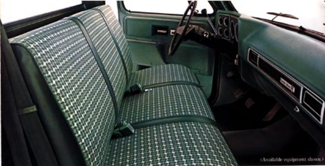
(Available equipment shown.)

Custom Deluxe trim - it's standard. Chevy's standard trim includes a wide range of comfort and appearance items. Included are: Full-width, foam-padded front bench seat Embossed vinyl upholstery in four color choices Single retractor lap and shoulder belt system Large padded armrests Padded sunshades Courtesy lamp Prismatic inside rearview mirror Foam-padded instrument panel pad with nameplate Exterior items include: bright rearview mirrors White painted front bumper and wheels with bright hubcaps.