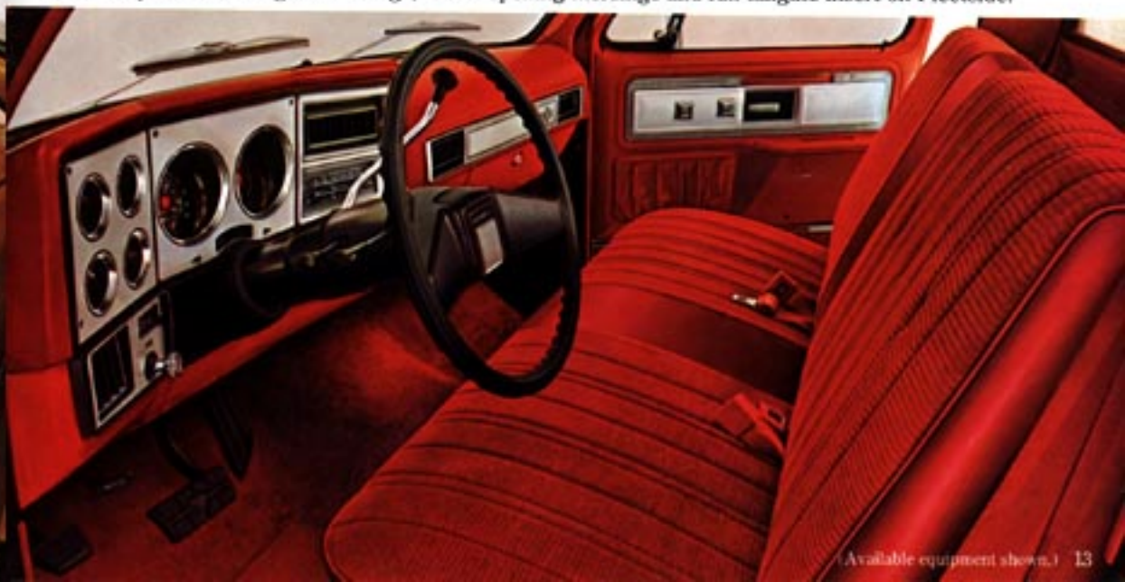
(Available equipment shown.)