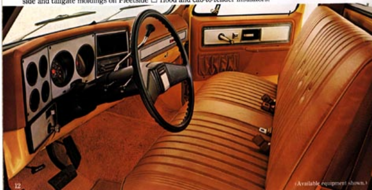
(Available equipment shown.)

Available Silverado trim - Chevy's finest. Includes all items in Cheyenne package for regular cabs and all items in Scottsdale package for Crew and Bonus Cabs, plus these major items: Bright brush-finished instrument cluster frame and matching insert on instrument panel pad Needle-type, full-gage instrumentation Full door trim panels with bright trim Color-keyed carpeting on lower door panels Choice of Custom cloth-and-vinyl or Custom all-vinyl seat trim Bright upper and lower body side and tailgate moldings, wheel opening moldings and full tailgate insert on Fleetside.