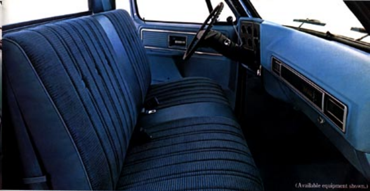
(Available equipment shown.)

Available Cheyenne trim. All Scottsdale items plus these major items: Silver diamond-patterned instrument cluster frame and matching insert on instrument panel pad Bright door trim panel inserts Door storage pockets Color-keyed carpeting Perforated, color-keyed headliner Custom steering wheel Extra-thick floor insulation Headliner insulation Bright tailgate insert, upper body side and tailgate moldings on Fleetside Hood and cab-to-fender insulators.