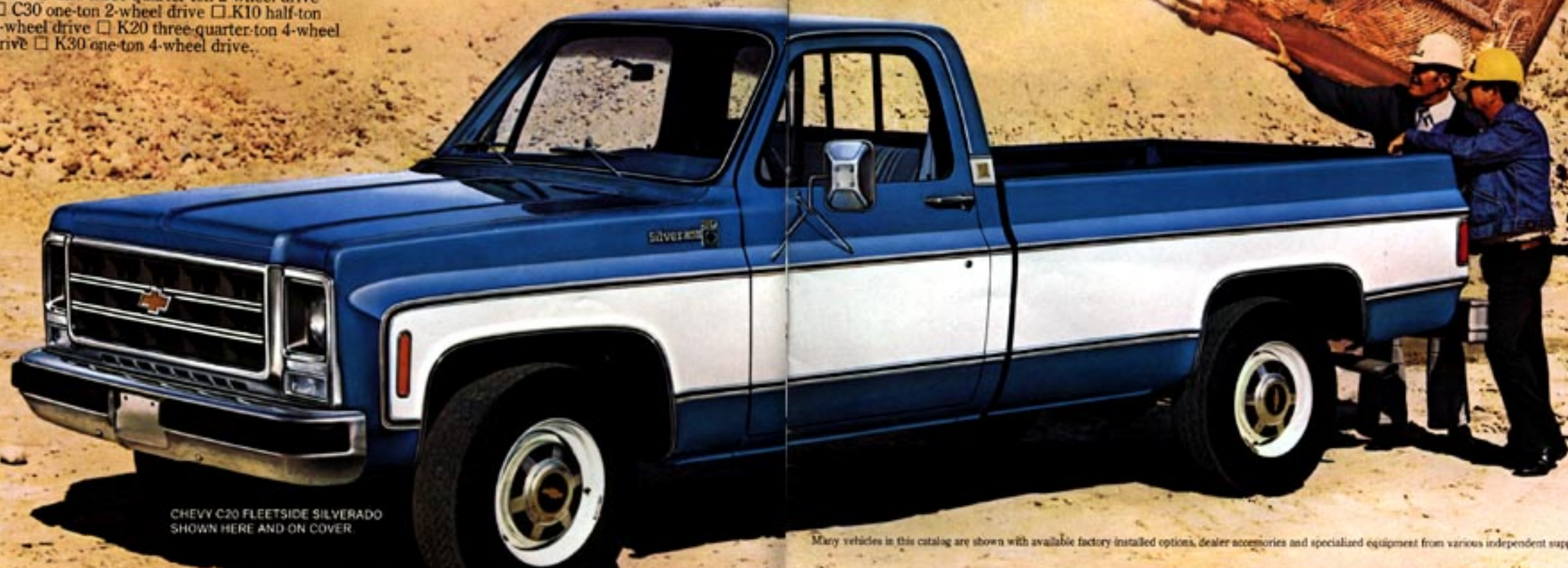
CHEVY C20 FLEETSIDE SILVERADO SHOWN HERE AND ON COVER

Many vehicles in this catalog are shown with available factory installed options, dealer accessories and specialized equipment from various independent suppliers.