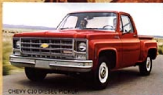
CHEVY C10 DIESEL PICKUP

Rugged Chevy diesel pickup. Chevy's C10 half-ton diesel pickup comes in Fleetside and Stepside models. It features a 5.7 Litre V8 diesel engine. See page 10 for the full story.